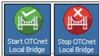
Figure 3. Start and Stop OTCnet Local Bridge icons